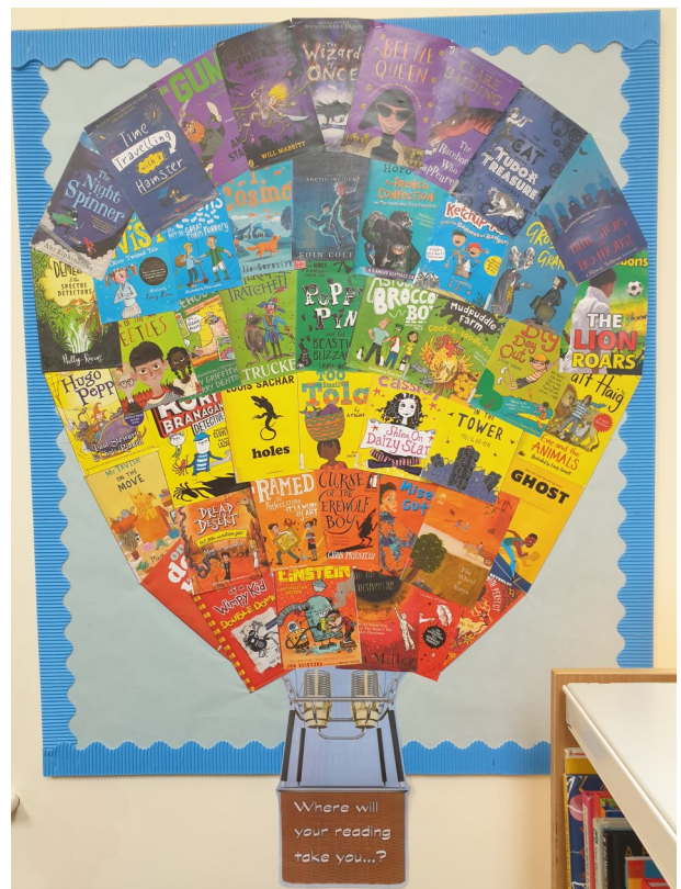
ENCOURAGING A LOVE OF READING