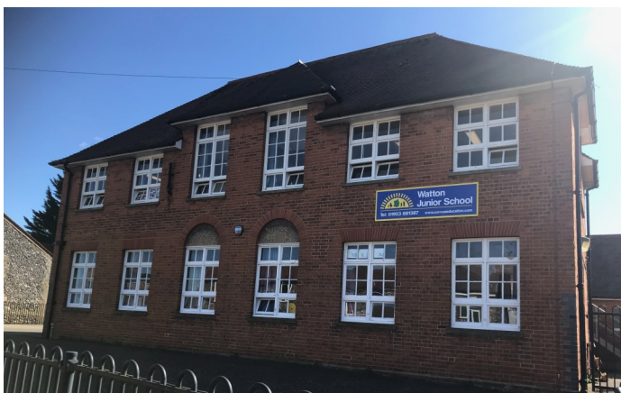
OUR SCHOOL-MAIN ENTRANCE