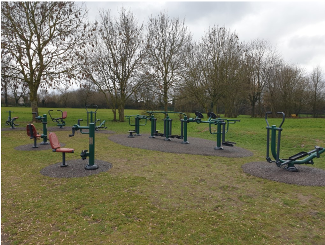
OUTDOOR GYM EQUIPMENT

Inspiring Learning We make the most of our fantastic school grounds and forest schools areas by taking our learning outdoors when we can. The arts, music and sports remain extremely popular; we hold Maths Weeks, Science events & outdoor learning week.